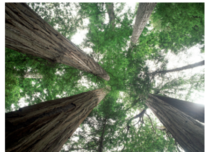
Quis nulluptat. Dui bla